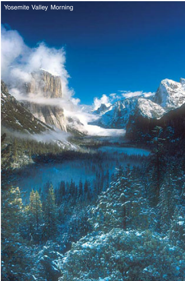
Yosemite Valley Morning

ing" which was a planned image. Shot from the Tunnel View overlook made famous by Ansel Adams, I knew exactly what the view would be like from there even though I had never been there before. Yosemite is one of the easiest places to find information on but on the Internet and in books. I went there over Christmas in the hopes of seeing it in ways that aren't seen as often but nearly got snowed out. The afternoon I arrived it was snowing heavily. On a drive around the valley loop I couldn't even see El Capitan or any of the other famous landmarks, even as I drove directly beneath them. Overnight, the snow stopped though, although it was still somewhat fogged in as I headed into the park around dawn on Christmas Eve morning. Driving up to Tunnel View in the hopes of seeing over the fog proved to be a winner. In this