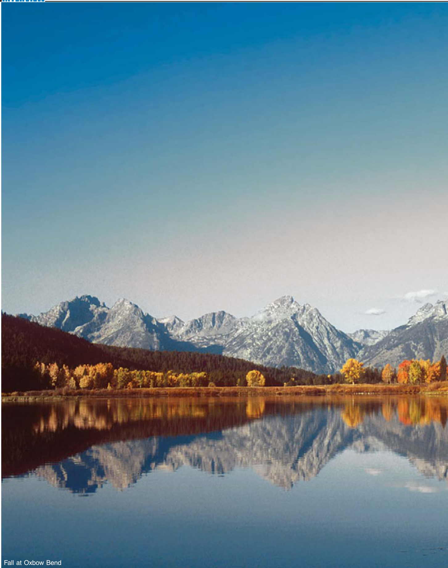
Fall at Oxbow Bend