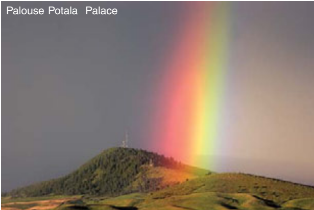
Palouse Potala Palace

Who is your 'guru'? Who are the nature and landscape