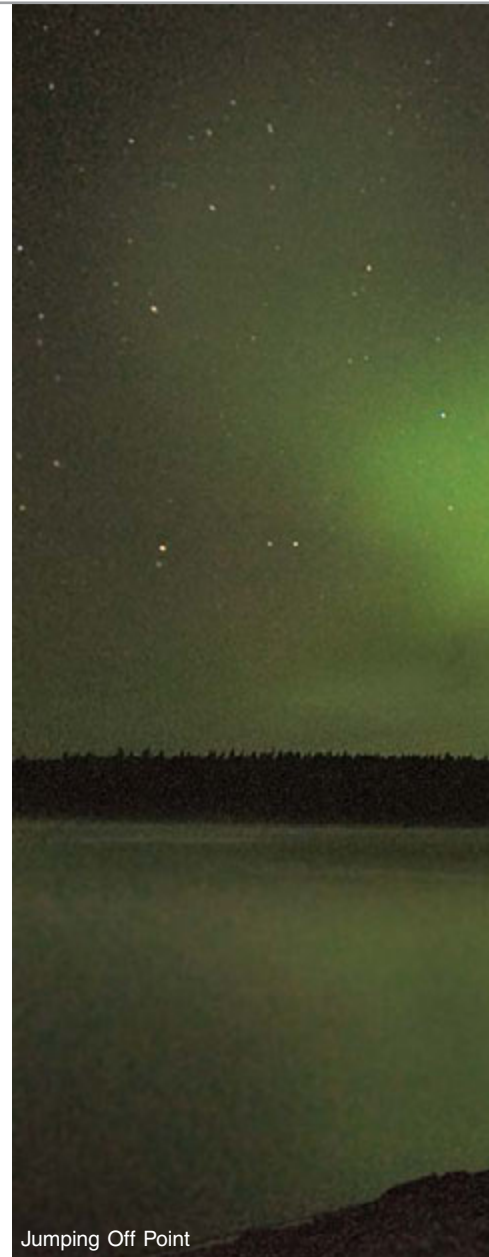
Jumping Off Point

We feel that higher-end digital cameras are superior to