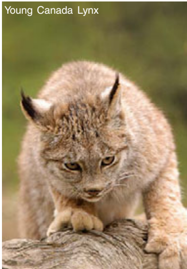
Young Canada Lynx